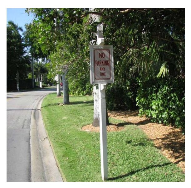
# # #